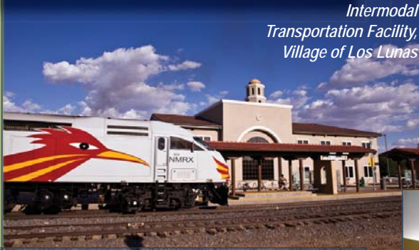
Intermodal Transportation Facility, Village of Los Lunas