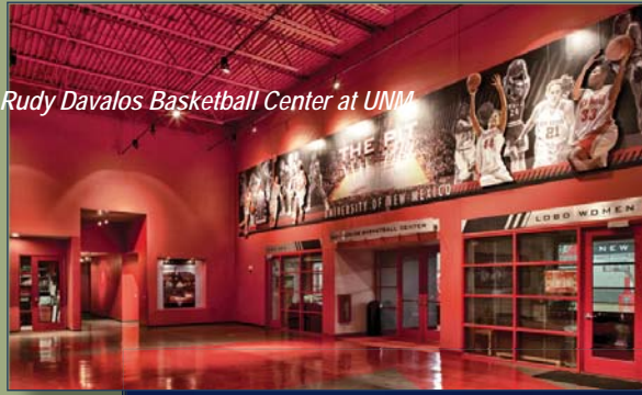
Rudy Davalos Basketball Center at UNM