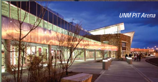
UNM PIT Arena